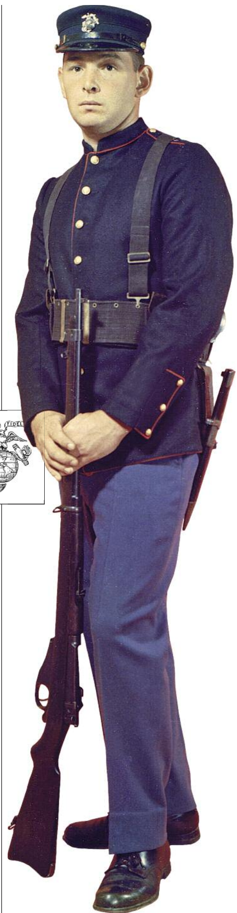
1963 studio portrait of Marine Corps uniform study. (Franklin Watts, Inc.)